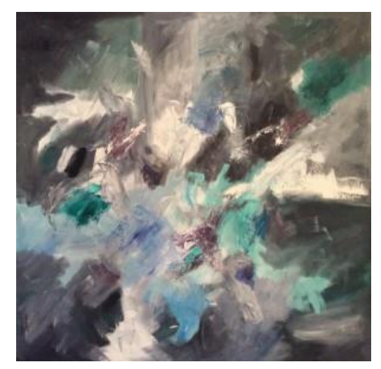
The Colors of Winter

Some of the art pieces are cozy, warm-up by the fire scenes while others just beg the viewer to take a walk through a winter wonderland. All of them will be on display for both the months of December and January in the Bank lobby. After viewing the exhibit in the bank from 4:00-5:00 p.m. go next door to meet all the artists and have a glass of wine and hors d'oeuvres with them from 4:00-6:00 p.m.