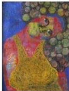
Music Curled Her Hair

Join us the second Wednesday of the month for a glass of wine and hors d'oeuvres, while viewing the new artwork and meeting the artists.