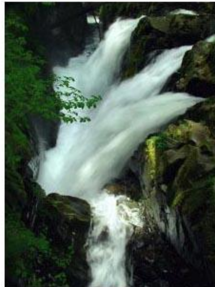
Sol Duc Falls