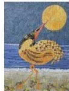
The Moon Watcher